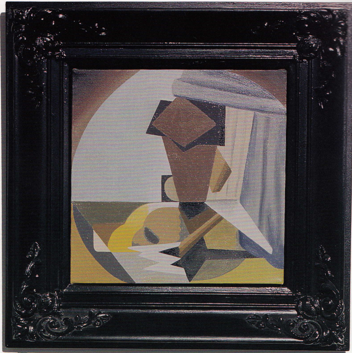
The Humanity of Abstract Painting , oil on canvas, 47 x 47 cm, 2002. (Private Collection)